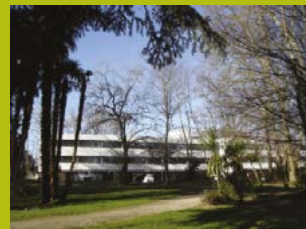
ISA-BTP - Anglet